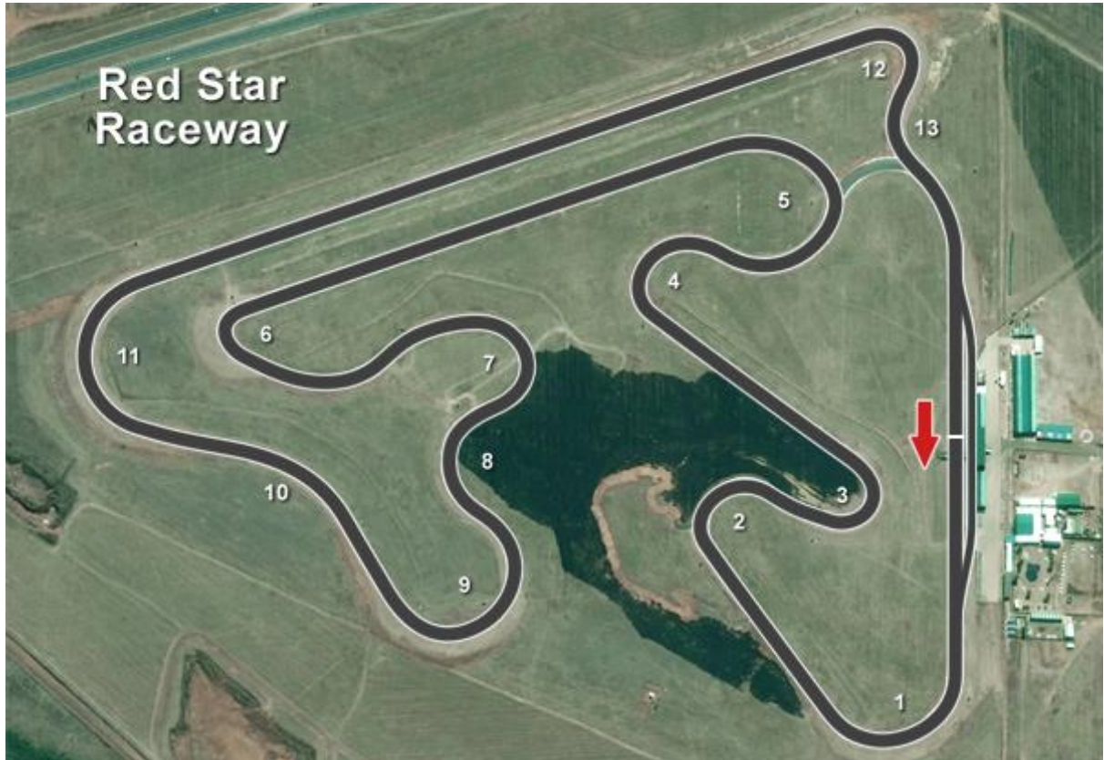
Aerial view of Red Star Raceway, Delmas.

It is important to note that camping is permitted at Red Star Raceway. There are several accommodation options close to the track.